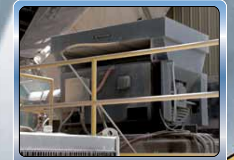
Preheater ID Fan

TECO-Westinghouse Motor Company has been a trusted brand for over 100 years. Although our processes have been refined, we remain committed to producing rugged and reliable products for the most demanding needs in the cement industry. Custom engineered induction squirrel cage, wound rotor, and synchronous motors, a wide variety of stock motors and low voltage drives, motor control centers, genuine Westinghouse renewal parts, and motor repair services are the foundation upon which you can build an industry.