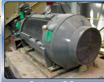
Baghouse ID Fan