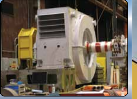
Synchronous Motor for Finish Mill